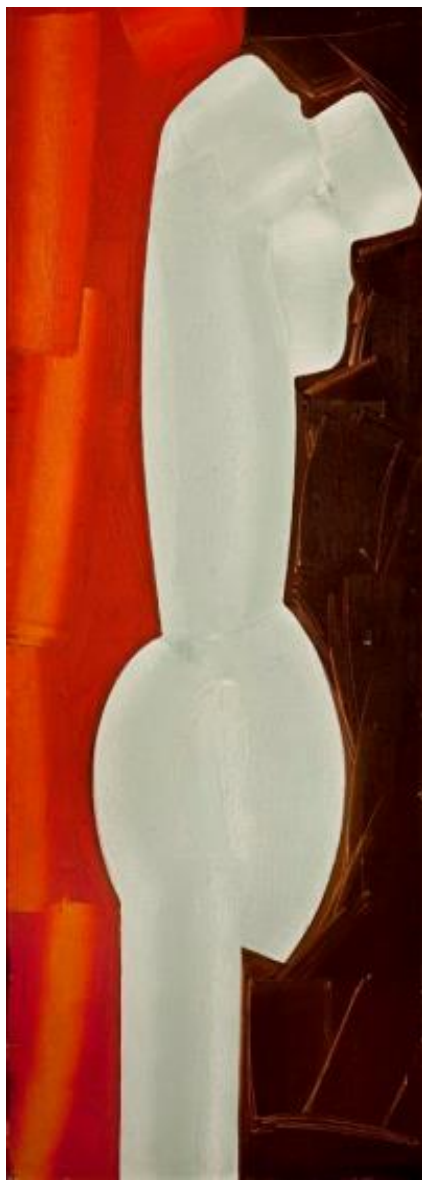
Sema, 1991 oil on canvas 192 x 70 cm