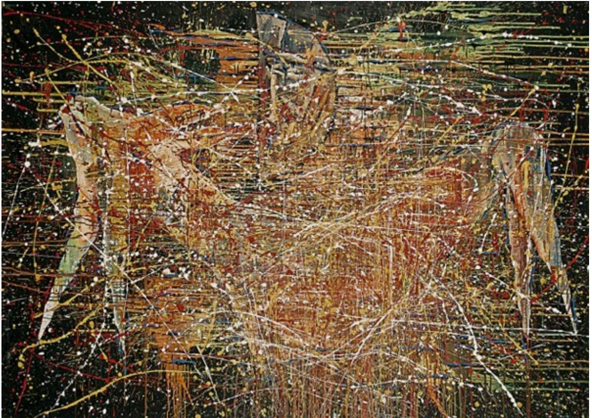
Untitled, 1991 oil on canvas 153 x 193 cm