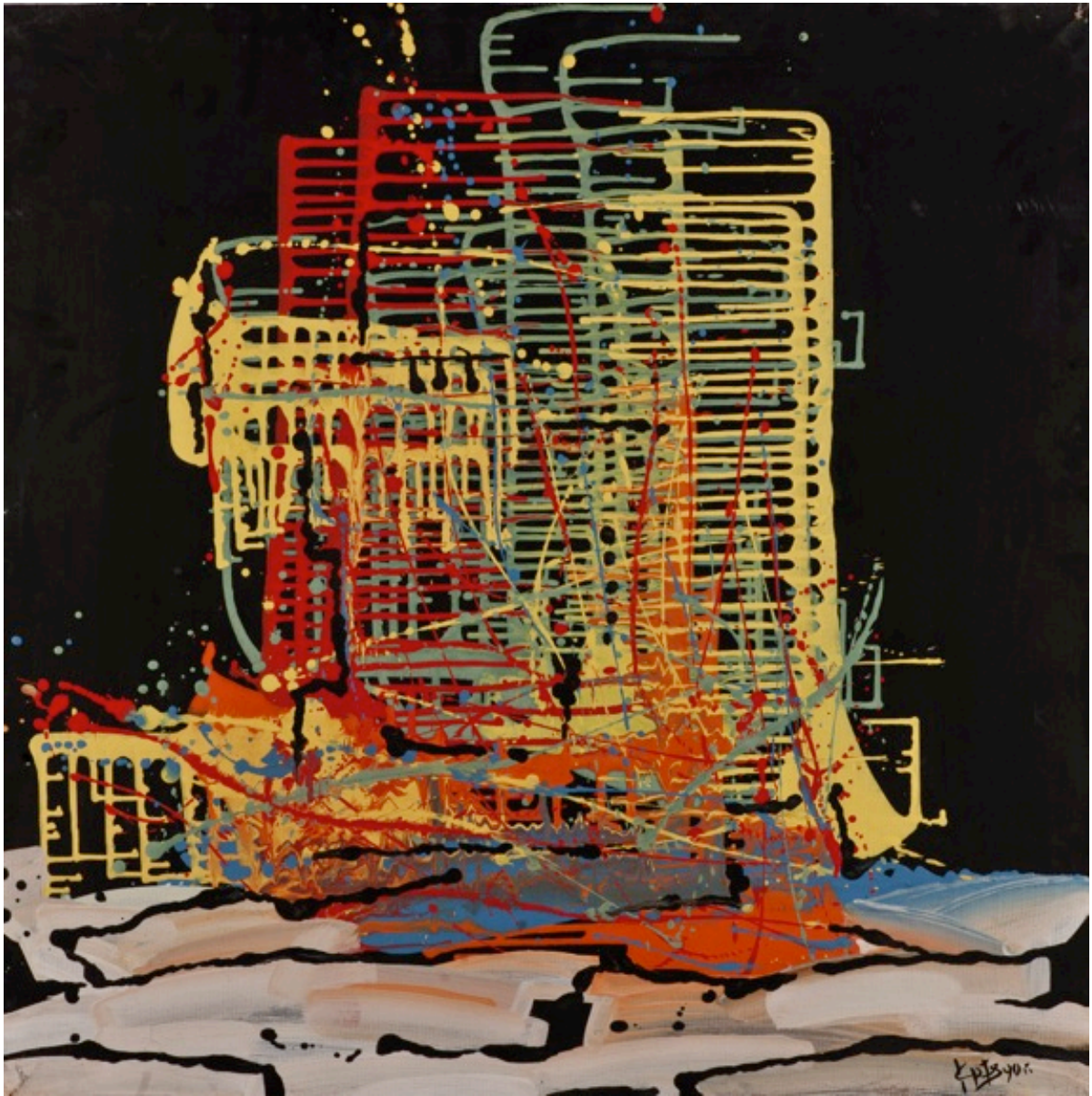
Constructions, 1990 oil on canvas 100 x 100 cm