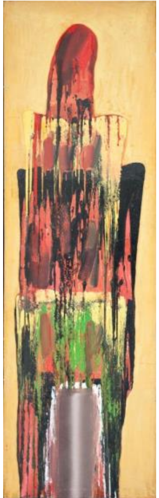
Forçe Majeure, 1991 oil on canvas 200 x 50 cm