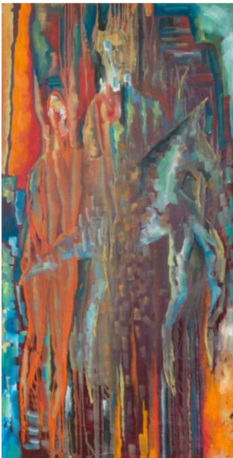
Untitled, 1990 oil on canvas 165 x 85 cm