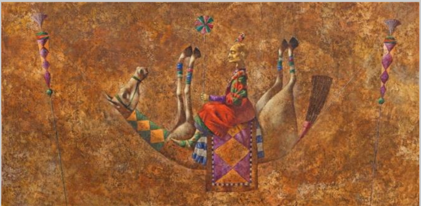
Chavandoz, 2014 oil on canvas 90 x 130 cm