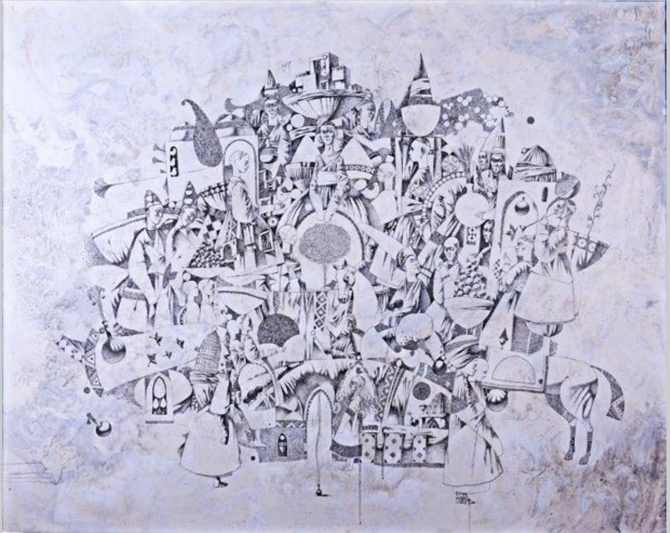
Tree of Desires, 2011 indian ink on canvas 125 x 150 cm