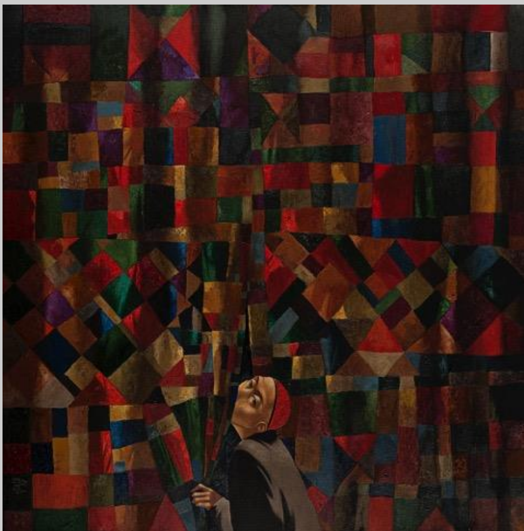
Behind-the-scenes, 2012 oil on canvas 90 x 90 cm