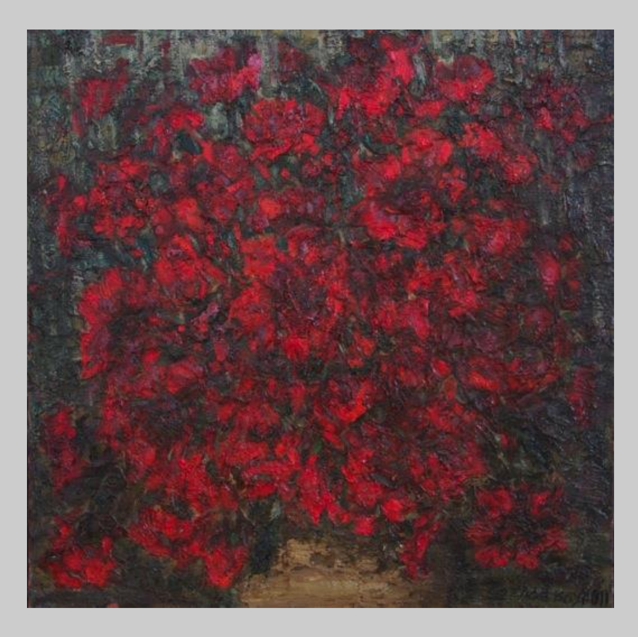
Red Still life, 2011 oil on canvas 85 x 95 cm