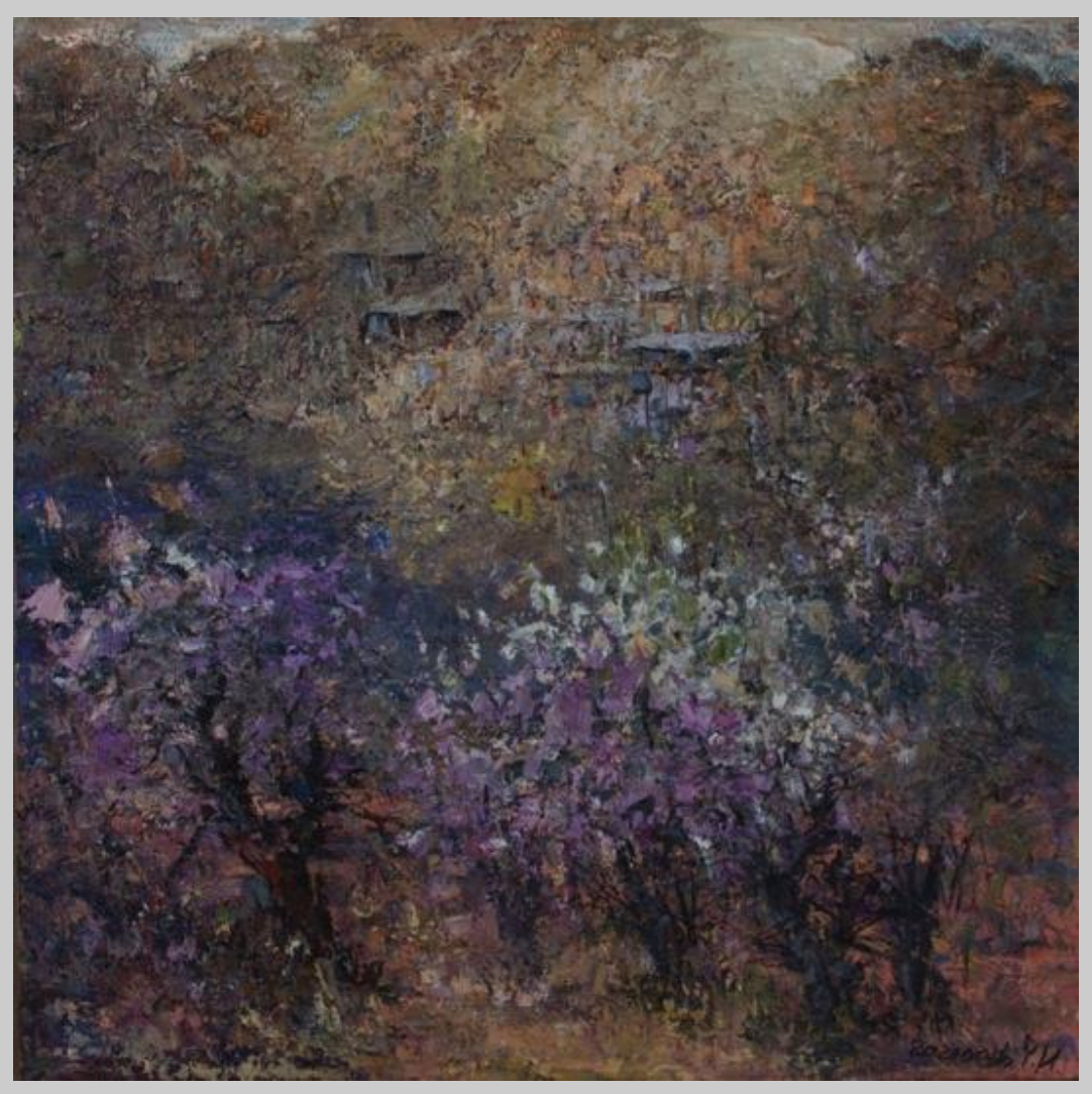
Mountain Bloom, 1996 – 2006 oil on canvas 100 x 100 cm Themaar Investment