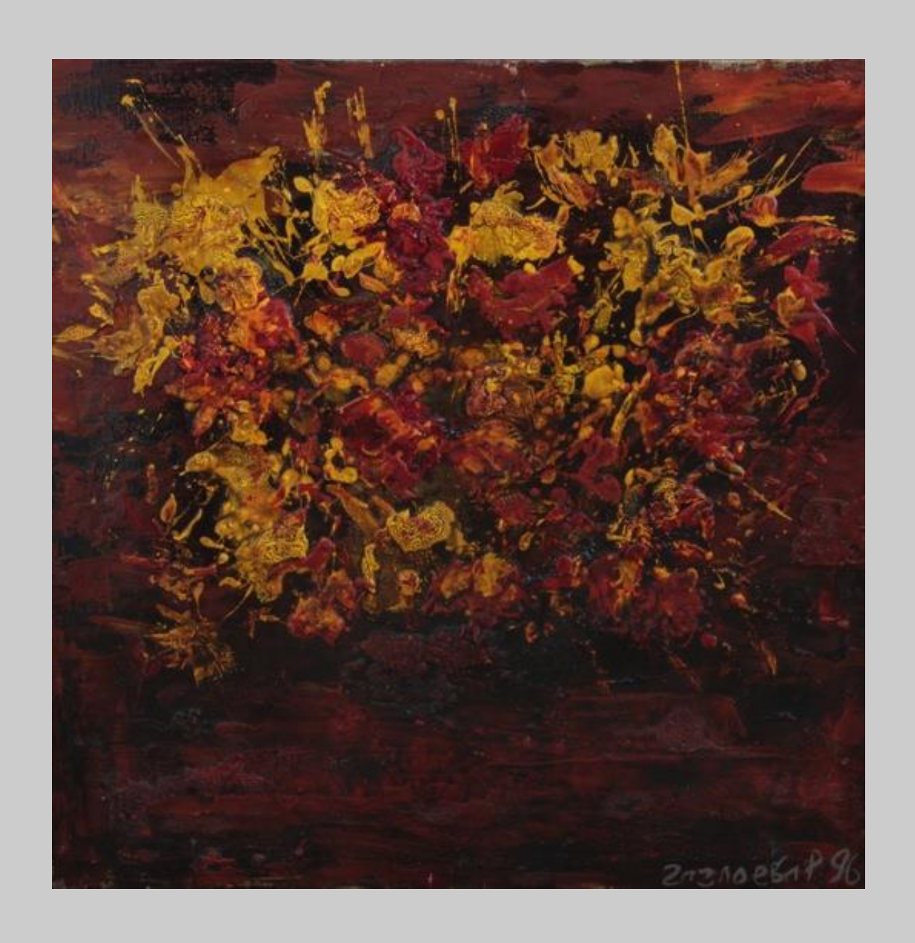
Still life, 1996 oil on canvas 80 x 70 cm