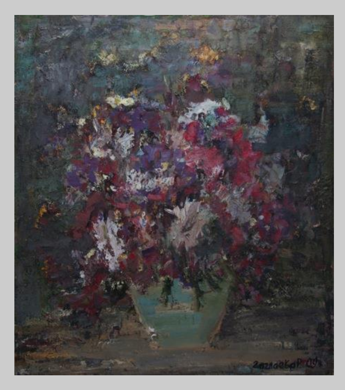
Mountain Flowers, 2009 oil on canvas 80 x 90 cm