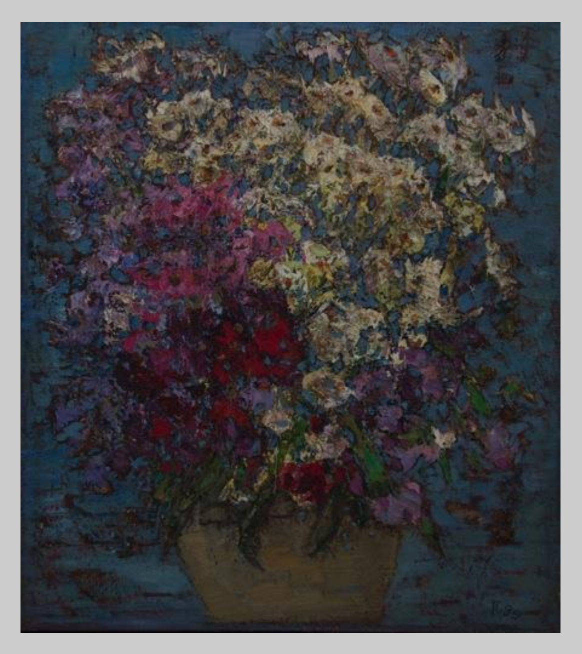
Still life, 1999 oil on canvas 90 x 80 cm