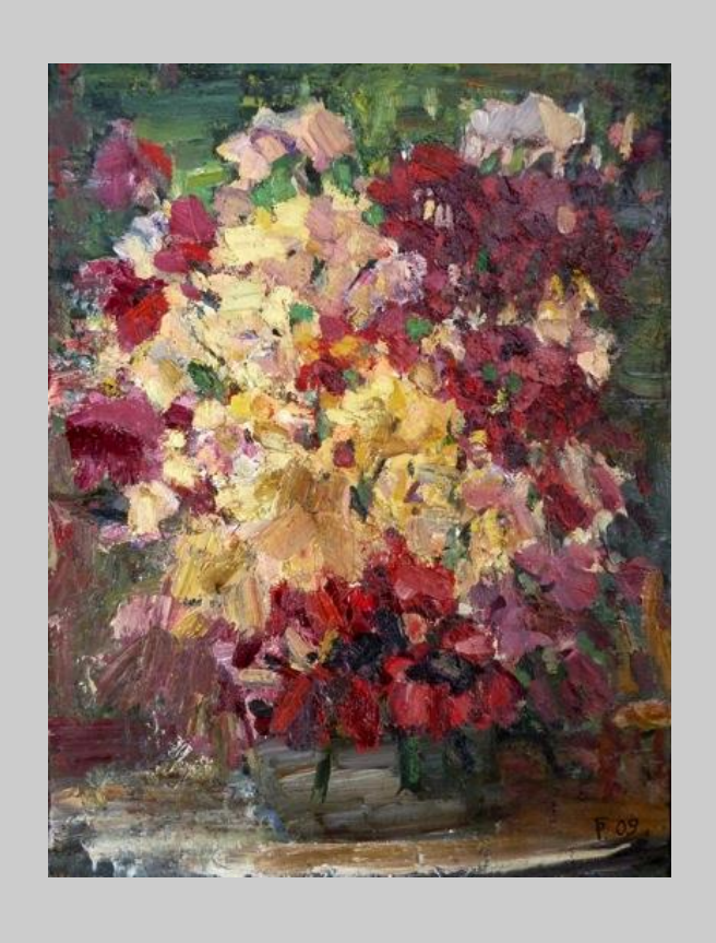
Still life, 2009 oil on canvas 90 x 70 cm

Still life flowers, 2009 oil on canvas 90 x 65 cm