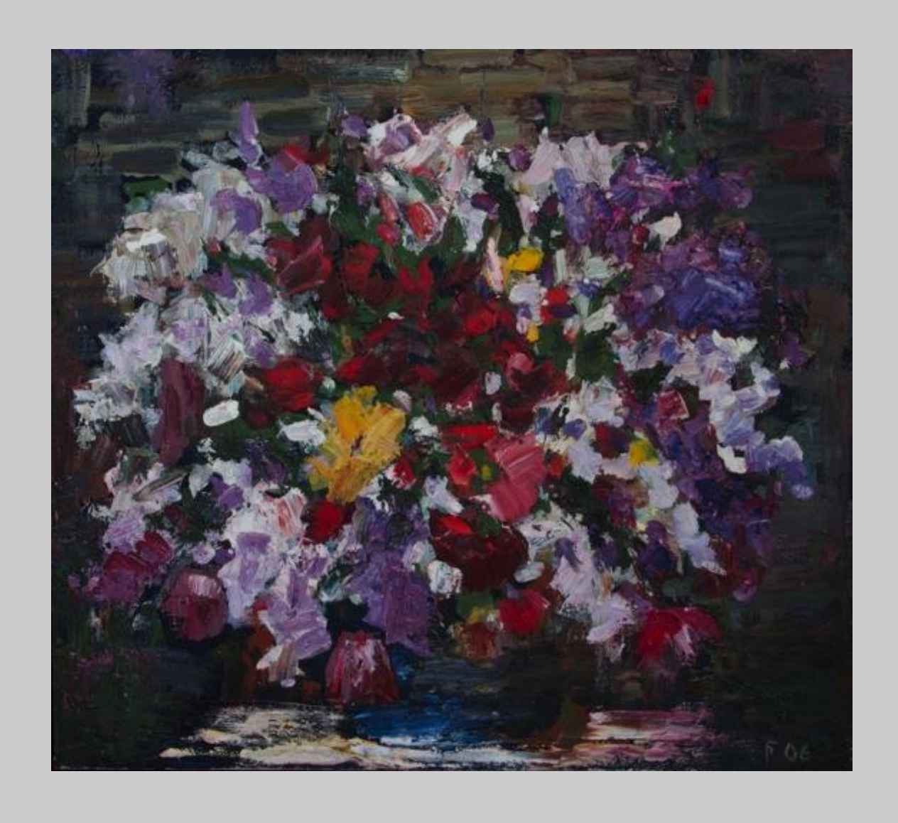
Flowers in the spring, 2006 oil on canvas 100 x 90 cm