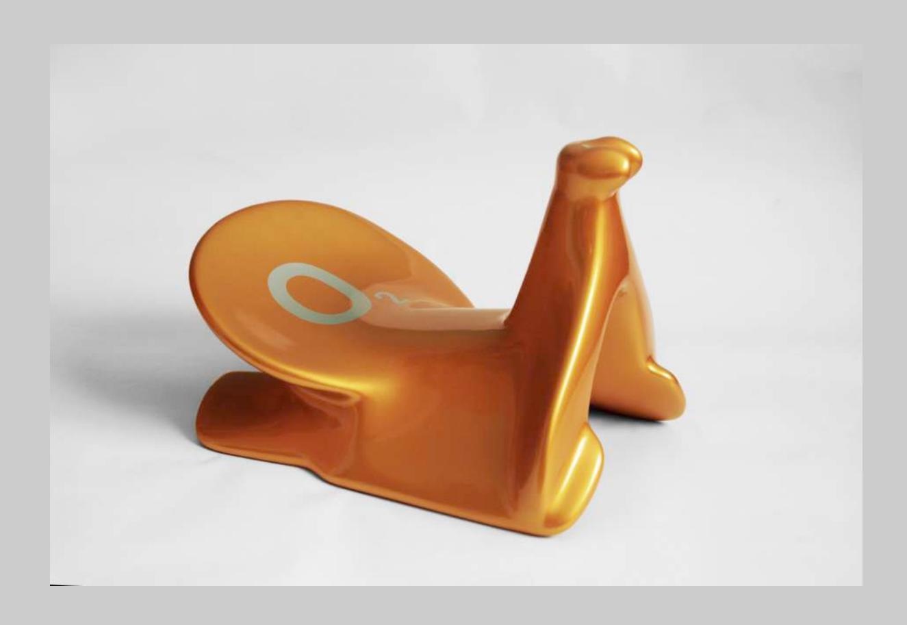
Saddle (Oxygen), 2017 wood and car paint 33 x 34 x 47 cm