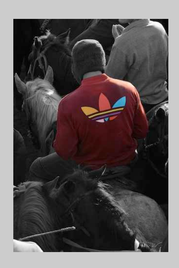
From the series Steppenwolf (Adidas), 2016 Photo print 105 \times 70 \text{ cm} Edition #: 1/5 + 1 AP