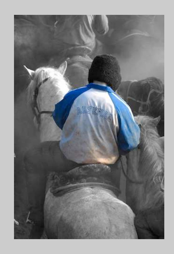
From the series Steppenwolf (Arsenal), 2014 Photo print 105 \times 70 \text{ cm} Edition #: 1/5 + 1 AP