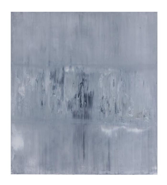
Rain, 2012 oil on canvas 80 x 70 cm