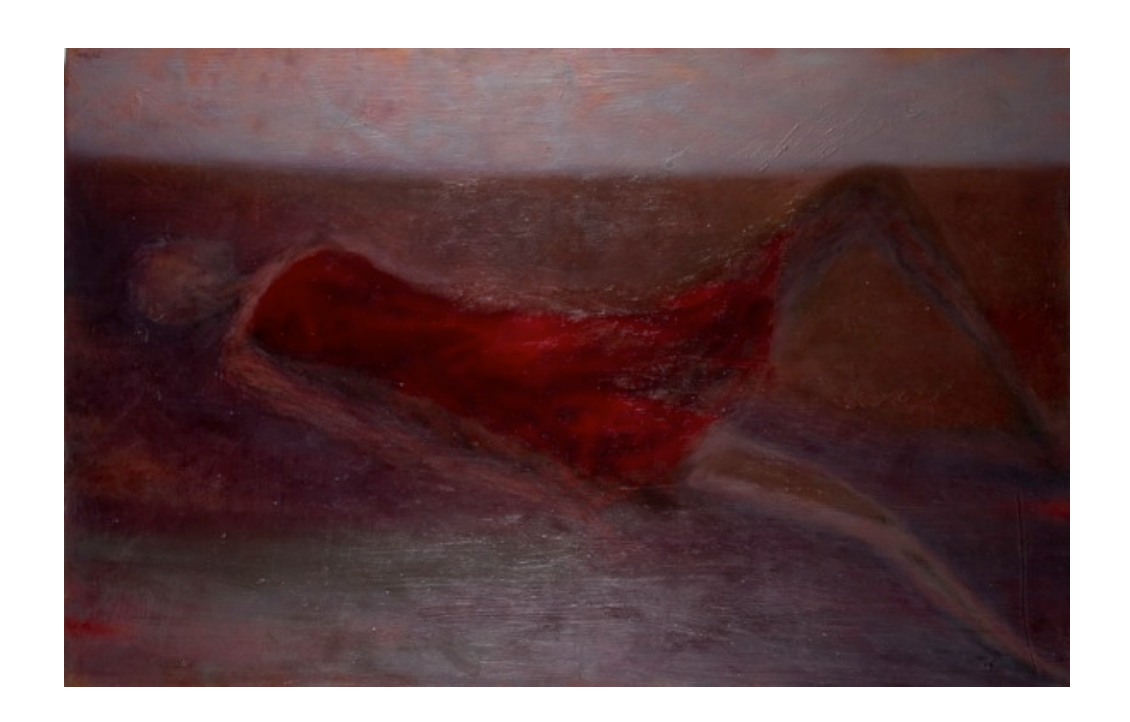
Red Dress, 2010 oil on canvas 110 x 170 cm