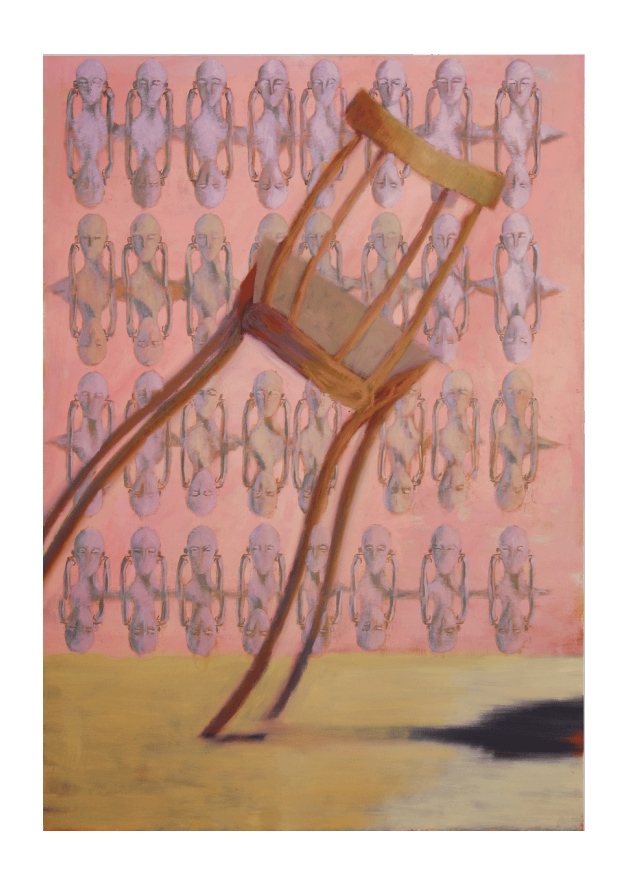
Untitled, 2014 oil on canvas 160 x 110 cm

Untitled, 2012 oil on canvas 160 x 120 cm