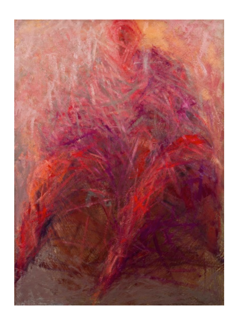
Untitled, 2012 acrylic on paper 90 x 70 cm