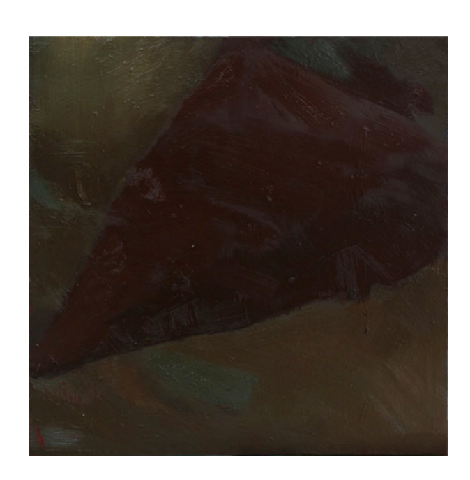
Chocolate cake, 2012 oil on canvas 120 x 120 cm