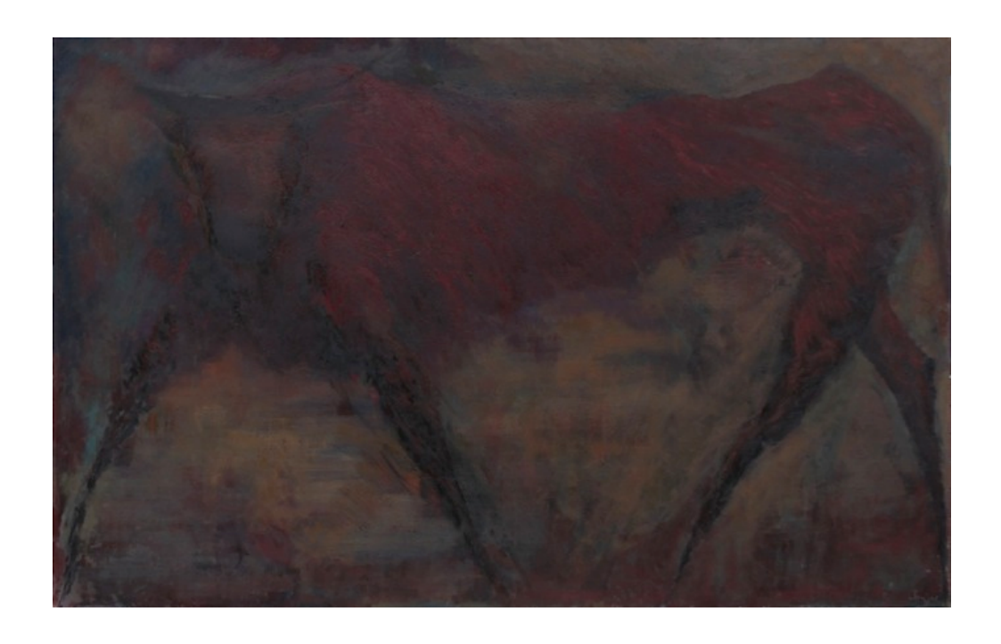
A Bull, 2012 oil on canvas 190 x 220 cm