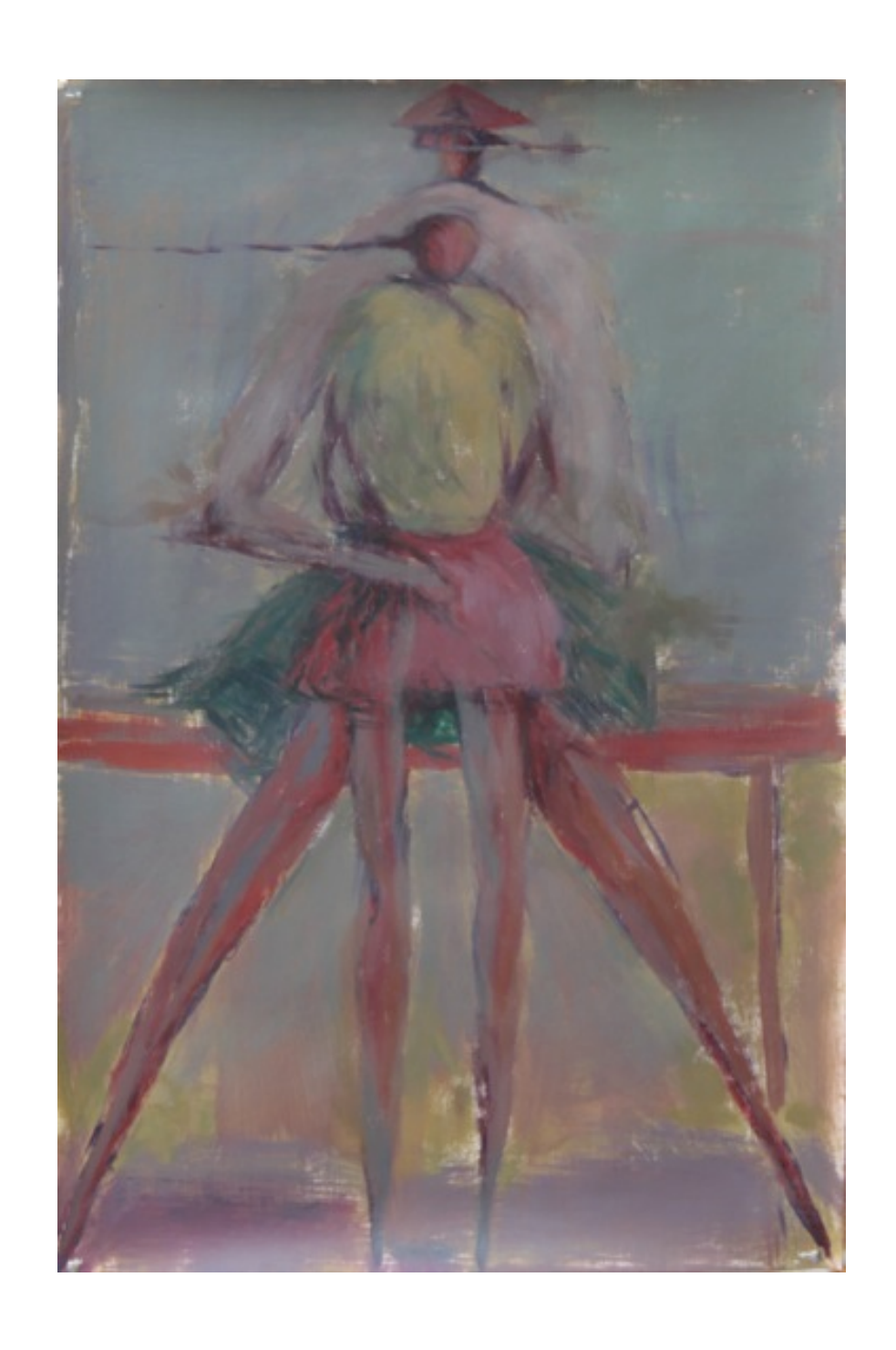
A Mother and Child, 2012 acrylic on paper 61 x 84cm