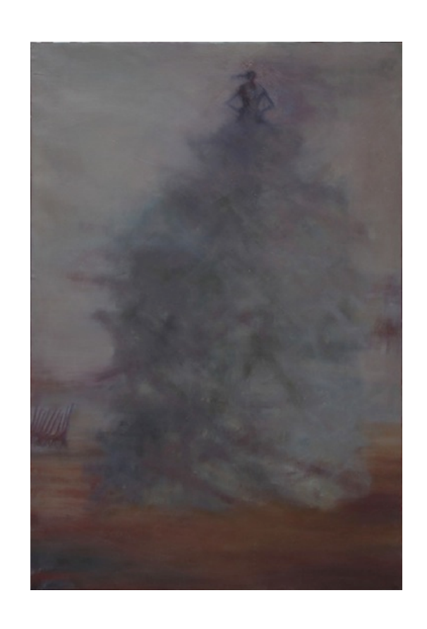
Anticipation, 2012 oil on canvas 145 x 94 cm

Untitled, 2012 Acrylic on paper 84 x 61 cm Osh Restaurant