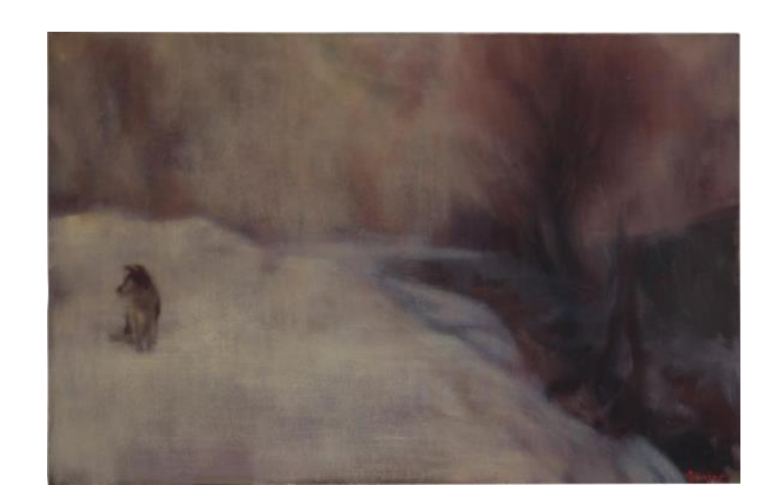
A Dog in the snow, 2012 oil on canvas 60 x 90 cm