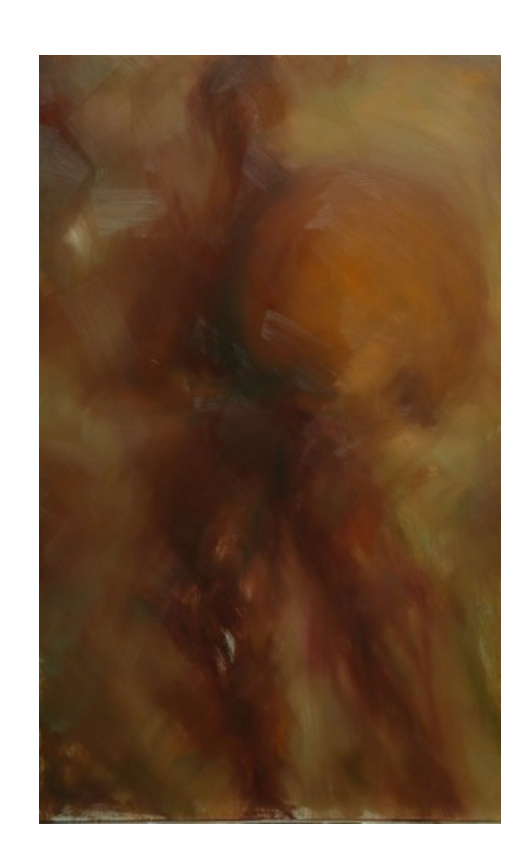
Tambourine player, 2012 oil on canvas 72.5 x 55.5 cm

Shout series V, 2010 oil on canvas 70 x 50cm