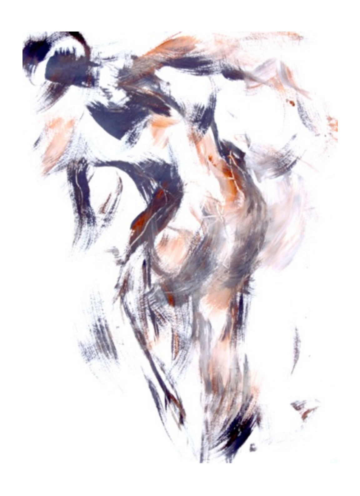
A Dancer, 2012 acrylic on paper 90 x 70 cm Osh Restaurant