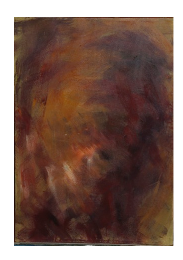
Shout series II, 2010 oil on canvas 70 x 50cm

Shout series I, 2010 oil on canvas 70 x 50cm