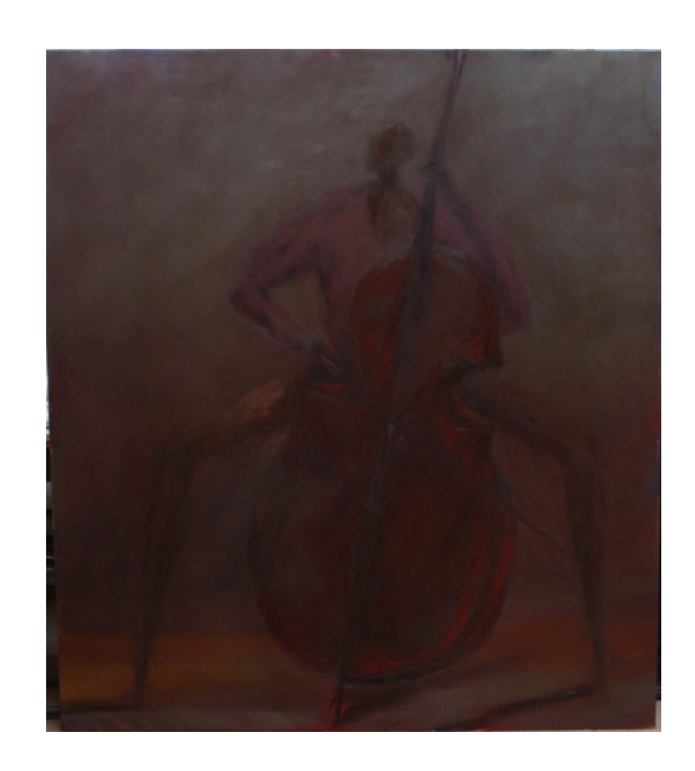
Cello player, 2012 oil on canvas 60 x 70 cm