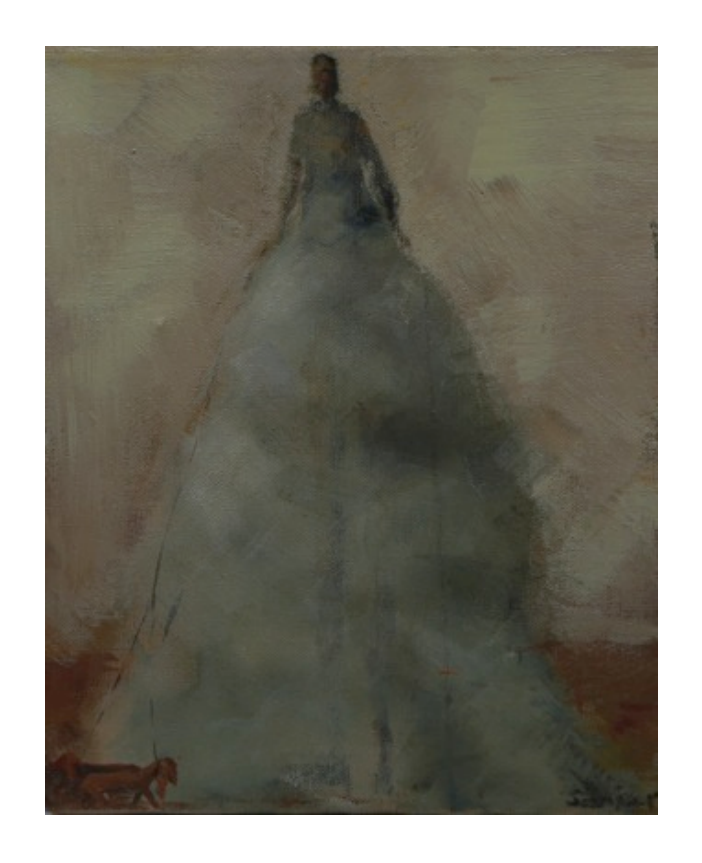
Untitled, 2012 oil on canvas 40 x 35 cm