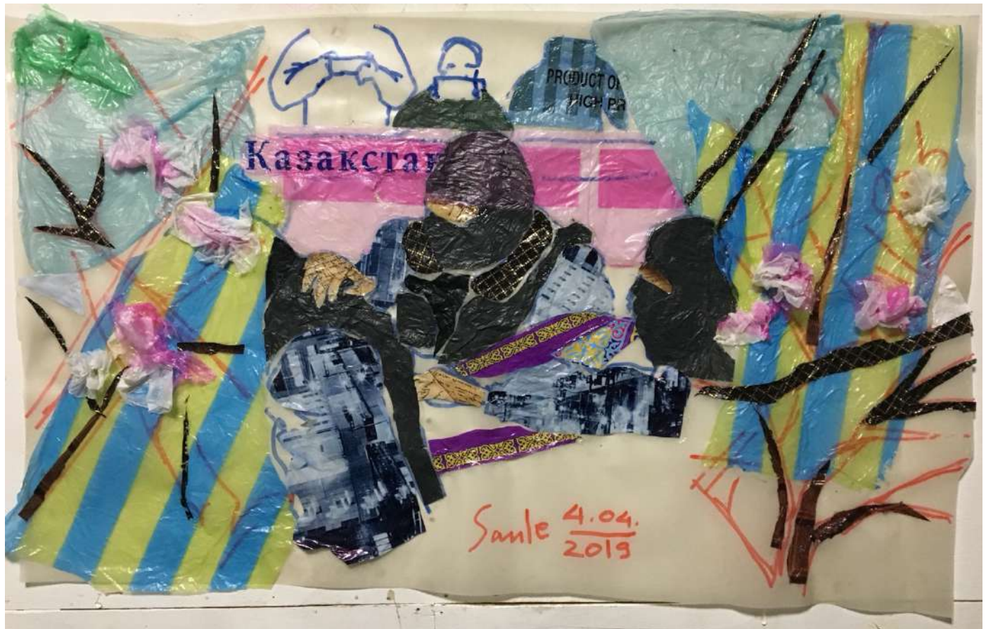
Blooming apricot and security officers, Plastic bags, polyethylene 50X70 cm 2019 2,000 USD