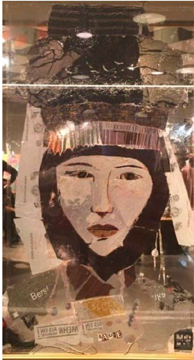
Kelin 2 Plastic bags, polycarbonate 152X 210 cm 2019 18,000 USD