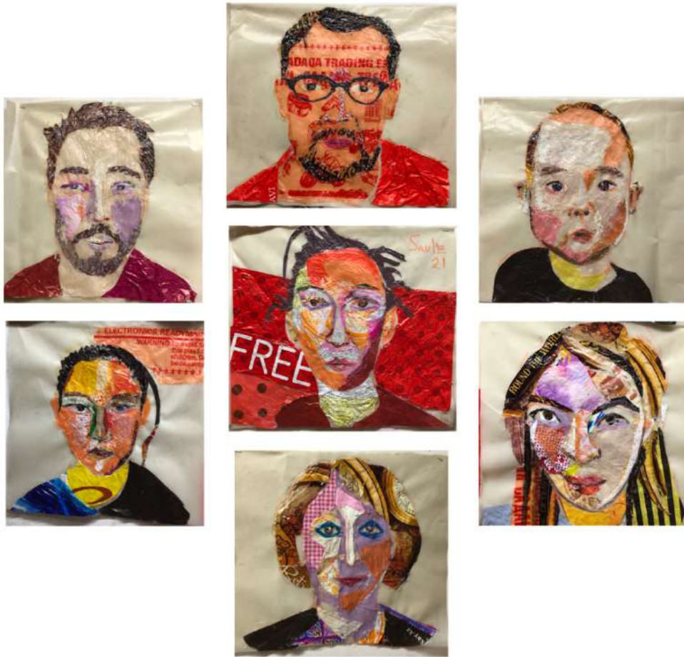
Seven selves of Mine Plastic bags on polyethylene 7 pieces: 36X36 cm each 2021 1,500 USD each