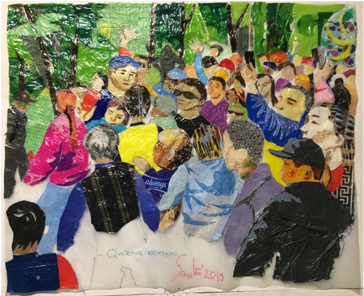
Qazaq Koktemi plastic bags, polythylene 75X94 cm 2019 7,000 USD