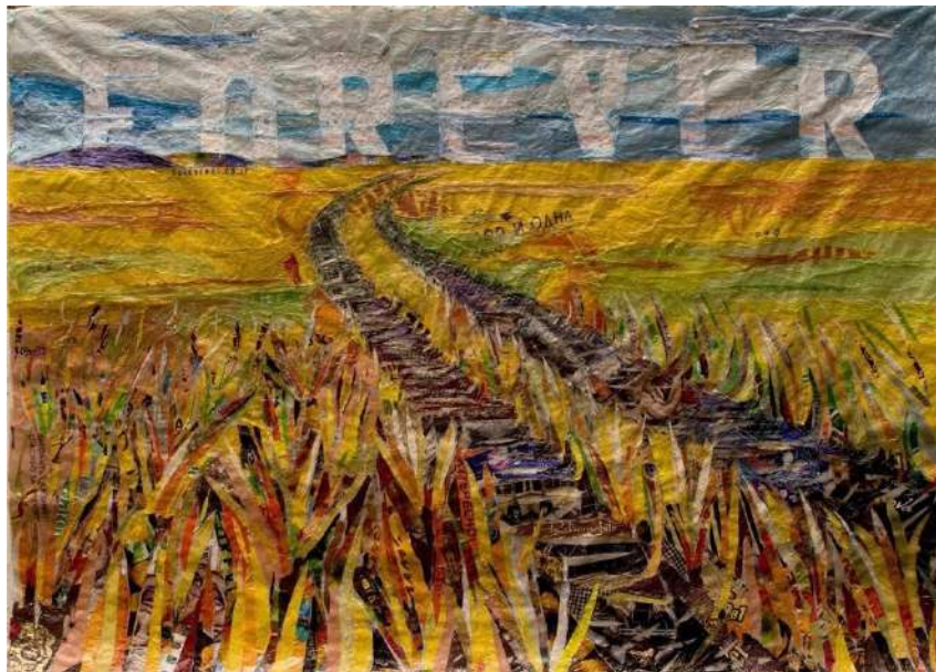
Part I, Forever, 12000 USD