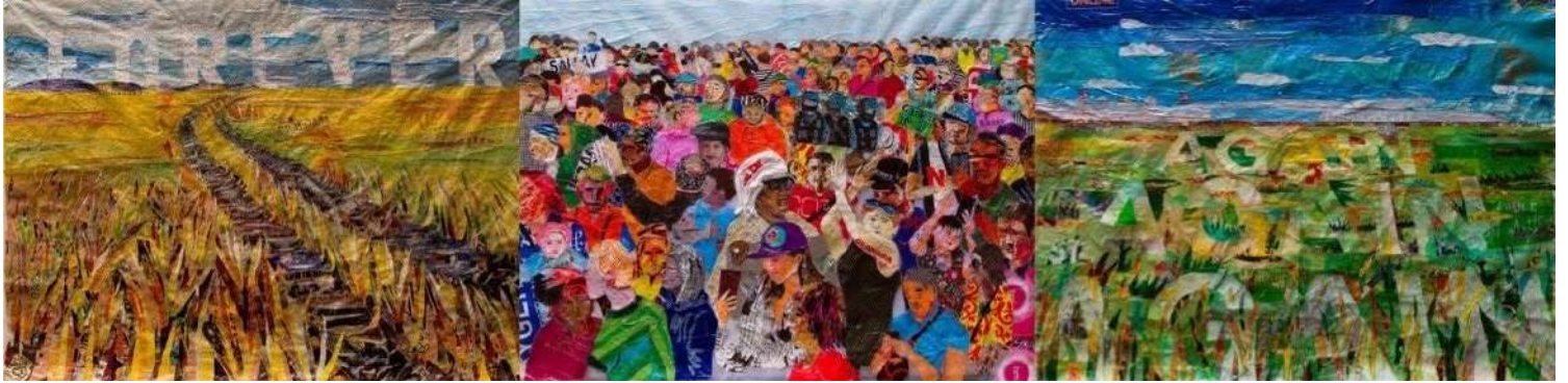
Plastic bags on polyethylene Triptych: each 132 x 185 cm 2019 40,000 USD