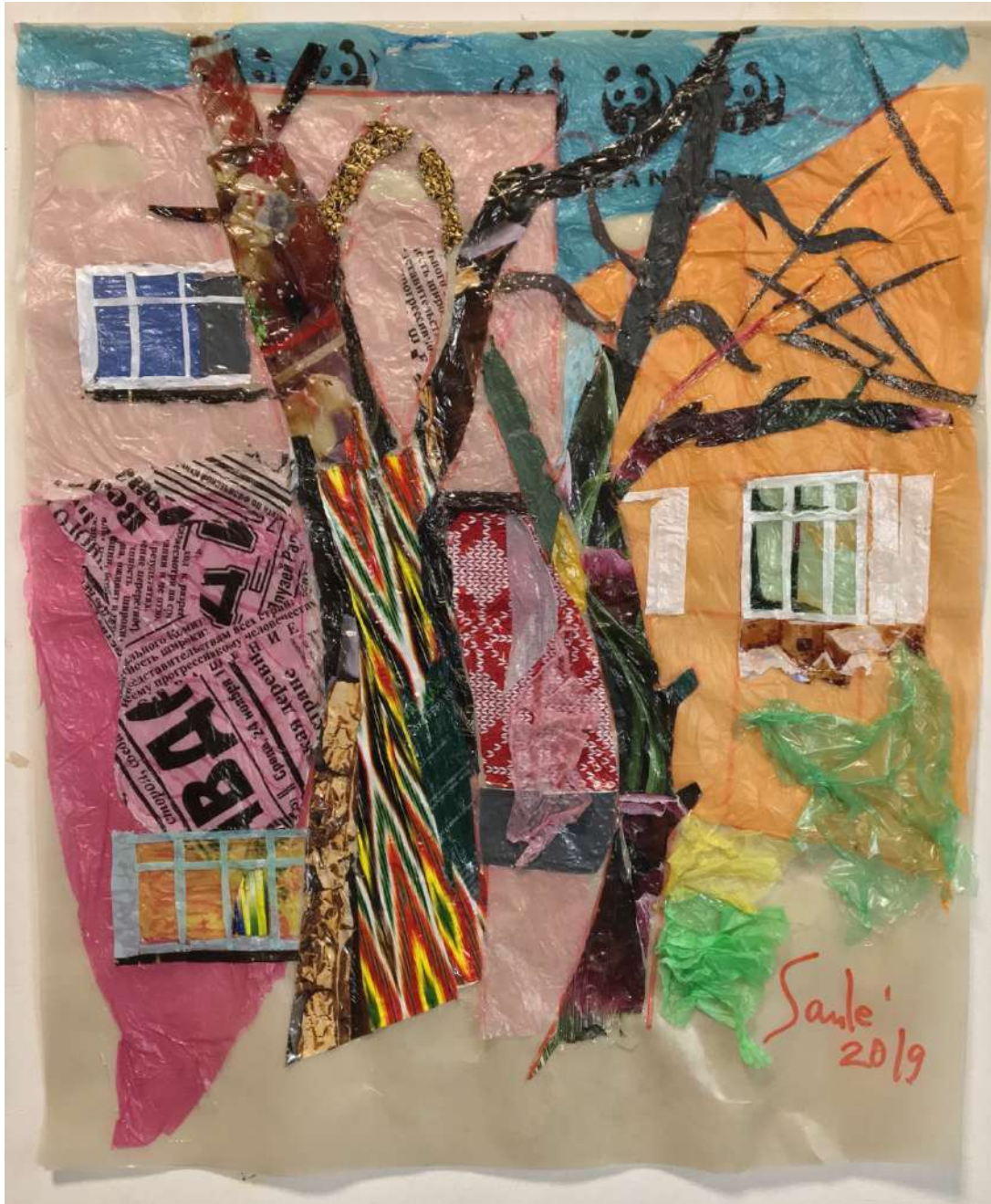
The first day, View from my window Plastic bags, polyethylene 70X56 cm 2019 2,000 USD