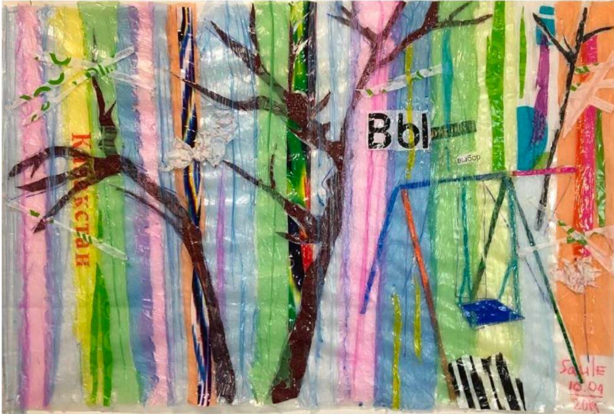
Rain. You are the choice Plastic bags, polyethylene 56X70 cm 2019 2,000 USD