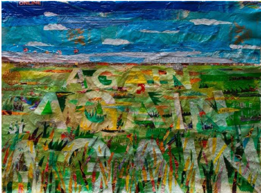
Part III, Again Again Again, 12,000 USD