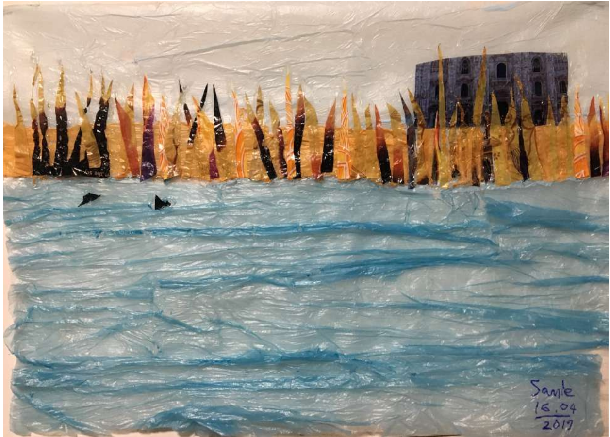
Diary of changes, Ulken, Balkhash Plastic bags on polyethylene 43X61 cm 2019 2,000 USD