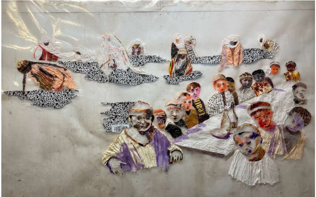
Kindergarten picking cotton, Tashkent 1929. From the series Residual Memory Plastic bags on polyethylene 135 x 150 cm 2020 10,000 USD