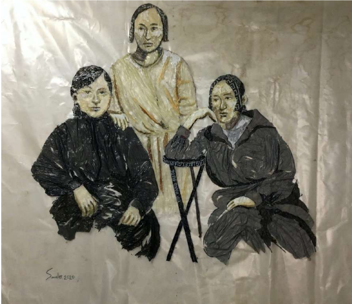
Mariam-apa. From the series Residual Memory Plastic bags on polyethylene 135 x 150 cm 2020 10,000 USD