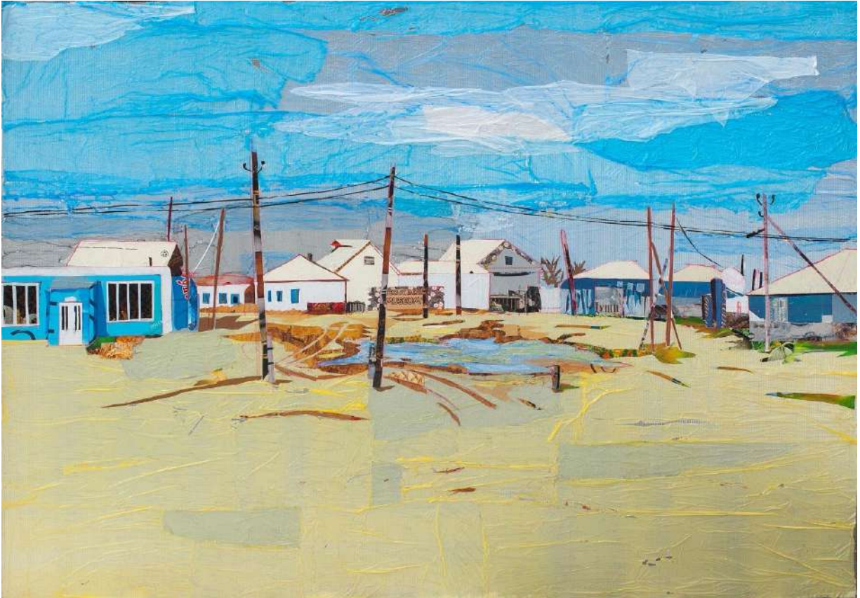
Aul at Spring Plastic bags, polycarbonate 105x210 cm 2017 cm 15,000 USD