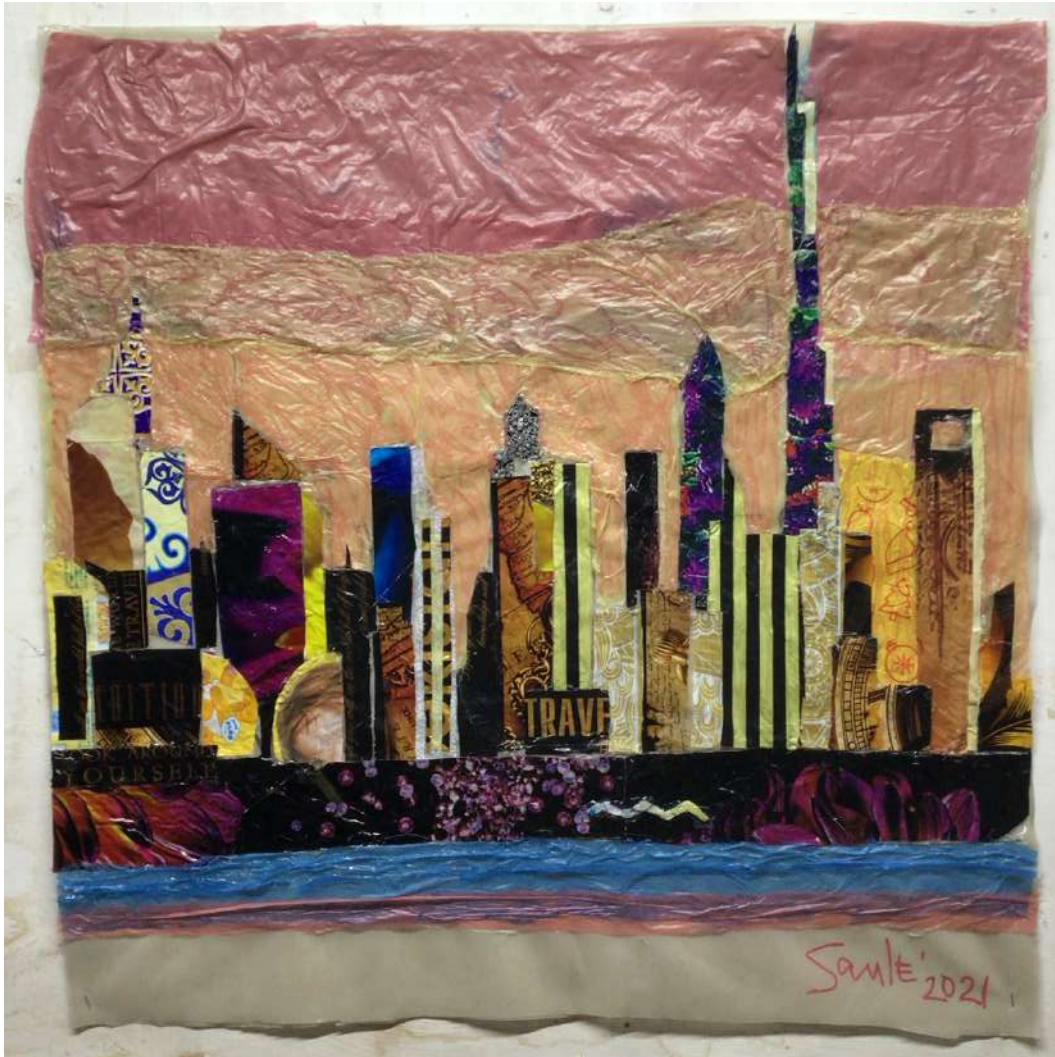
Dubai, DIFC Plastic bags on recycled polyethylene 73X72 cm 2021 6,000 USD