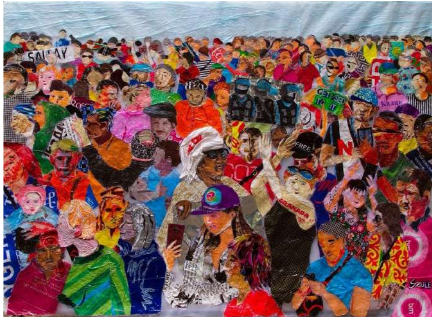
Part II, One Steppe Forward, 18,000 USD