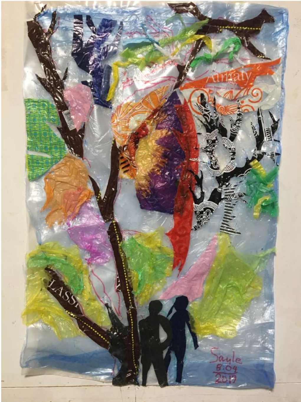
Diary of changes, The construction of the GLK on Kok Zhailau has been postponed, Plastic bags, polyethylene 70X56 cm 2019 2,000 USD