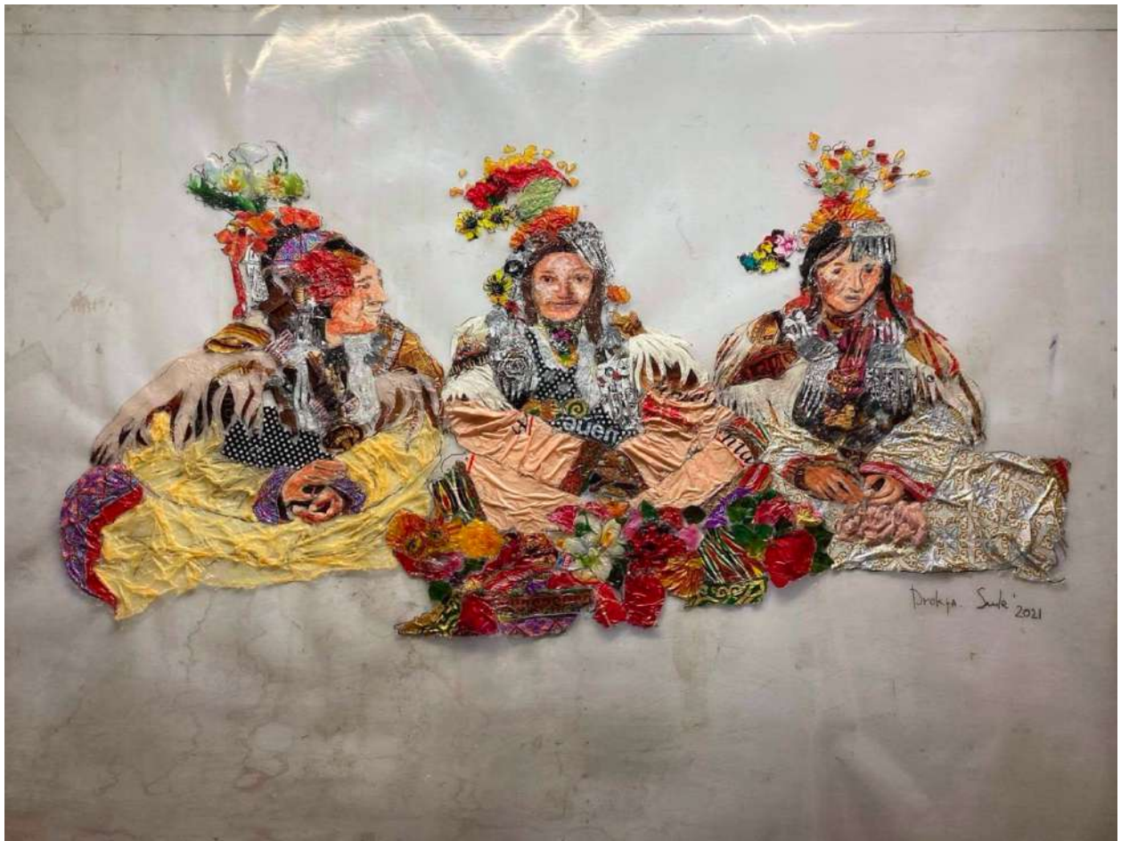
Drokpa. Üsh Kelin/Three Brides Plastic bags on polyethylene 145x 160 cm 2021 12,000 USD