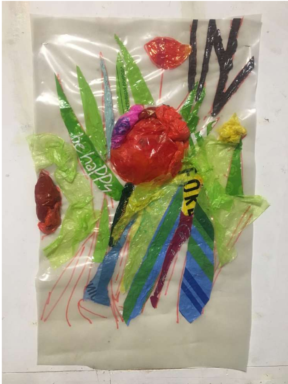
The first tulip through the netting netting in a neighboring yard, Plastic bags, polyethylene, 70X54 cm, 2019 2,000 USD