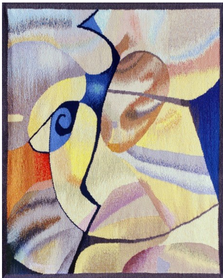
Autumnal Topography, 2001 Tapestry 120 x 95 cm 10,000 USD