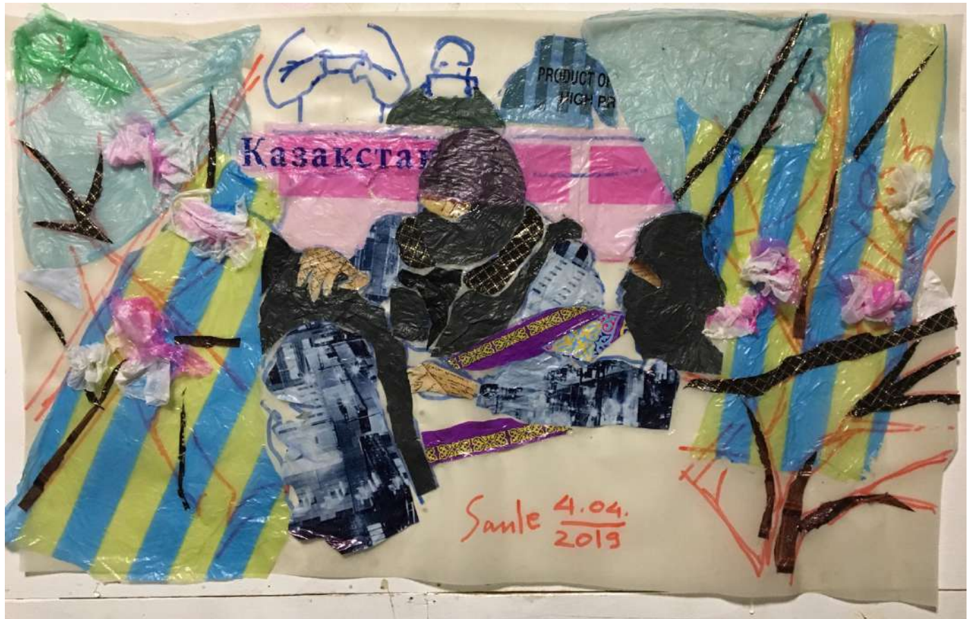
Blooming apricot and security officers, Plastic bags, polyethylene 50X70 cm 2019 2,000 USD