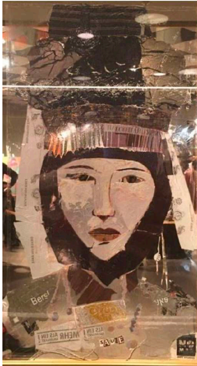
Kelin 2 Plastic bags, polycarbonate 152X 210 cm 2019 18,000 USD