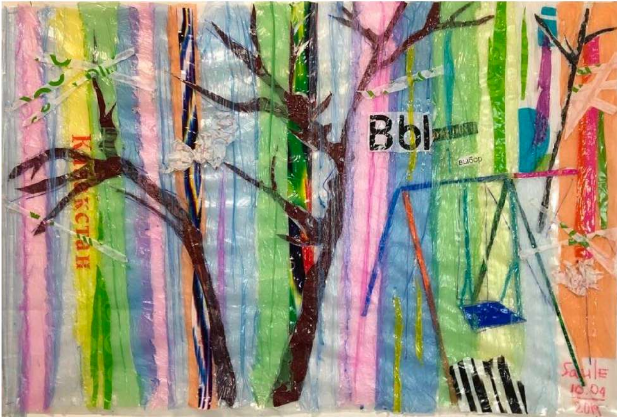
Rain. You are the choice Plastic bags, polyethylene 56X70 cm 2019 2,000 USD